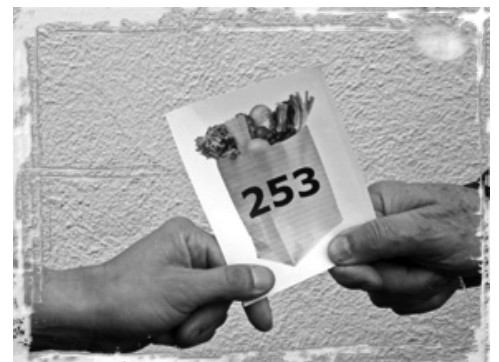
Taking a number to feed his family.

does what was once unthinkable: he asks for food provided by the food bank. Such stories go on and on... and so does the pain, the worry, and the fear of the future. As you continue to stand with us, you keep providing hope for people in need: for hungry children, seniors, the new poor, the disabled and the sick among us. Thank you for your unflinching support.